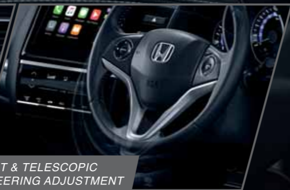
TILT & TELESCOPIC STEERING ADJUSTMENT