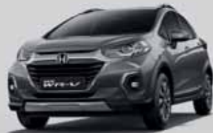
Modern Steel Metallic