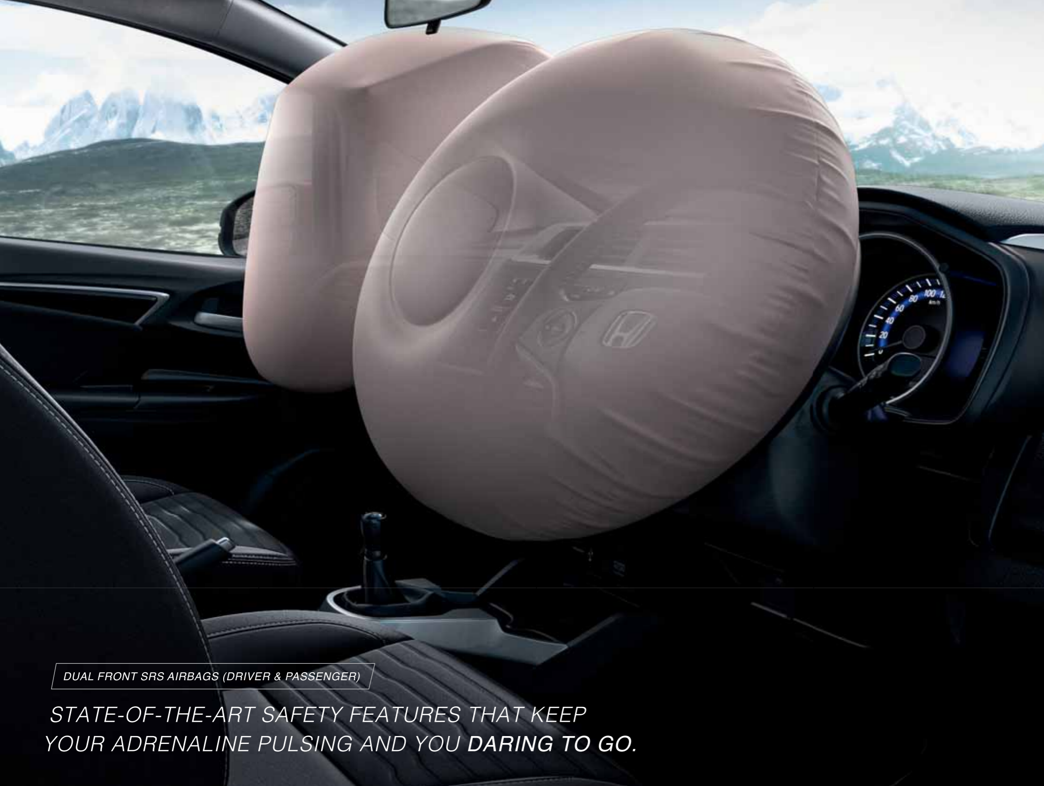
DUAL FRONT SRS AIRBAGS (DRIVER & PASSENGER)

STATE-OF-THE-ART SAFETY FEATURES THAT KEEP YOUR ADRENALINE PULSING AND YOU DARING TO GO.