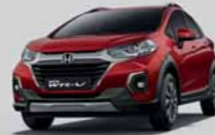
Radiant Red Metallic