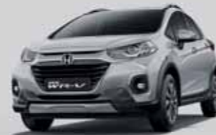
Platinum White Pearl