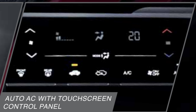
AUTO AC WITH TOUCHSCREEN CONTROL PANEL