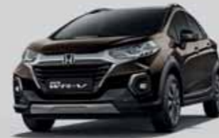
Golden Brown Metallic