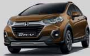
Premium Amber Metallic