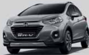
Lunar Silver Metallic