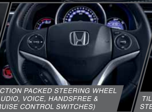
ACTION PACKED STEERING WHEEL (AUDIO, VOICE, HANDSFREE & CRUISE CONTROL SWITCHES)