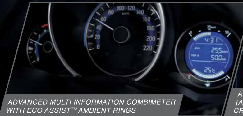
ADVANCED MULTI INFORMATION COMBIMETER WITH ECO ASSIST™ AMBIENT RINGS

COMFORTABLE. SPACIOUS. EXCLUSIVELY DESIGNED INTERIORS THAT KEEP YOUR ADVENTURES FREQUENT AND YOUR DRIVES DARING TO GO.