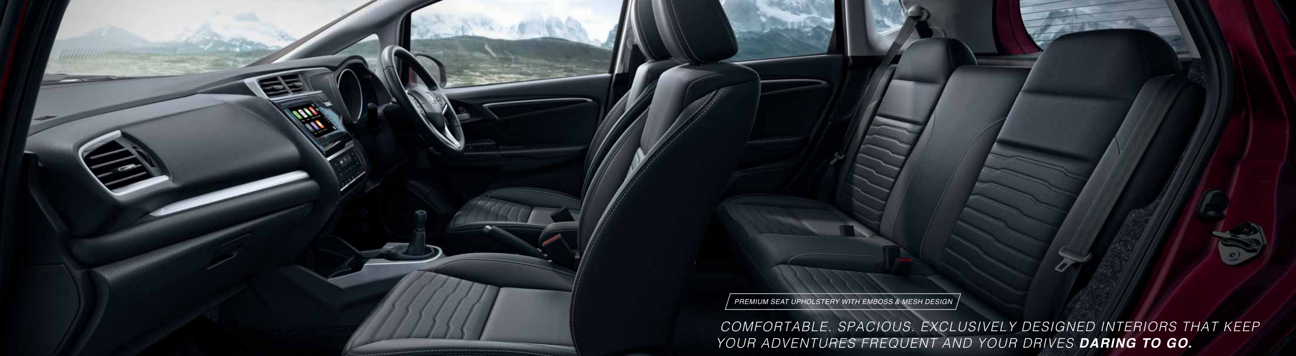
PREMIUM SEAT UPHOLSTERY WITH EMBOSS & MESH DESIGN

COMFORTABLE. SPACIOUS. EXCLUSIVELY DESIGNED INTERIORS THAT KEEP YOUR ADVENTURES FREQUENT AND YOUR DRIVES DARING TO GO.