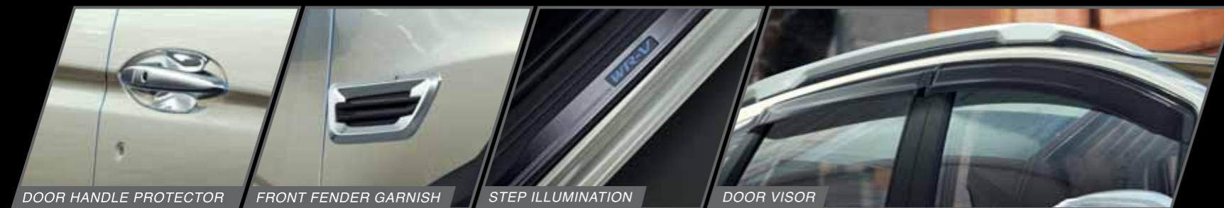
DOOR HANDLE PROTECTOR FRONT FENDER GARNISH STEP ILLUMINATION DOOR VISOR STYLE PACKAGE