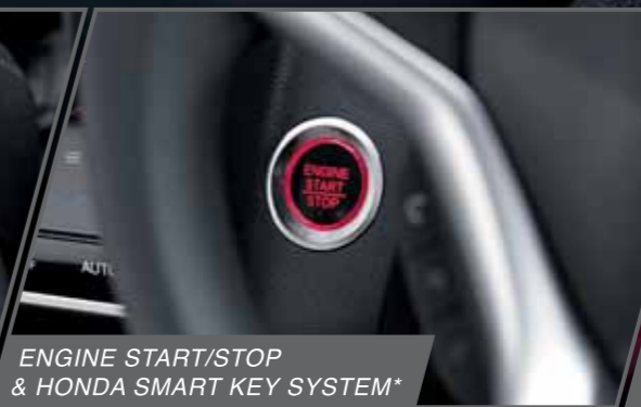
ENGINE START/STOP & HONDA SMART KEY SYSTEM*