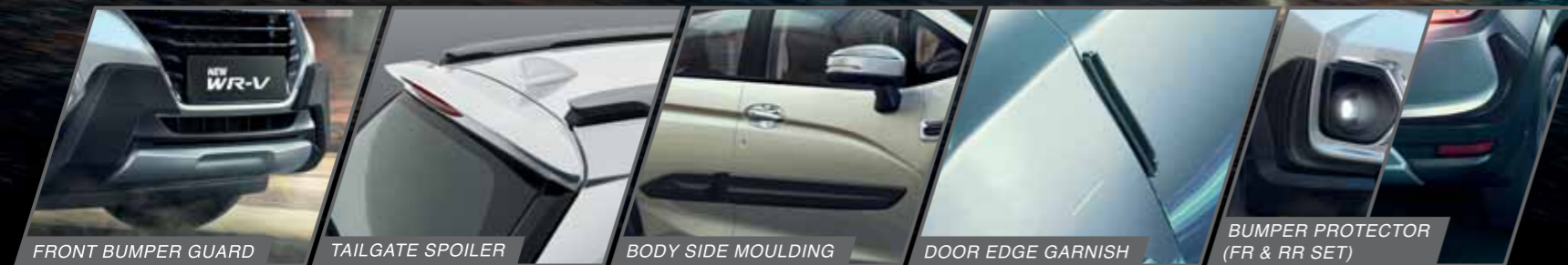
FRONT BUMPER GUARD TAILGATE SPOILER BODY SIDE MOULDING DOOR EDGE GARNISH BUMPER PROTECTOR (FR & RR SET) EXTERIOR PACKAGE

ACCESSORIES THAT DRESS FOR THRILL, FLAUNT STYLE, AND GET YOU DARING TO GO