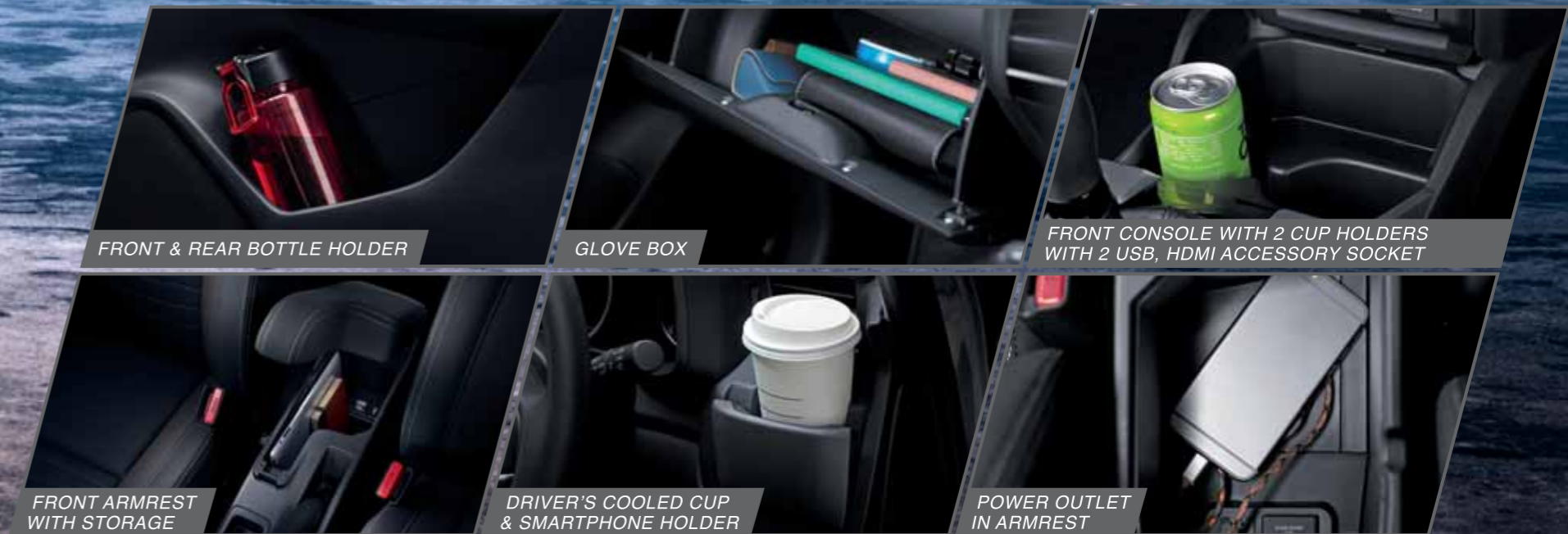
FRONT & REAR BOTTLE HOLDER

CONVENIENT STORAGE SPACE AND ROOM FOR ACTION-PACKED EXCITEMENT THAT'S DARING TO GO