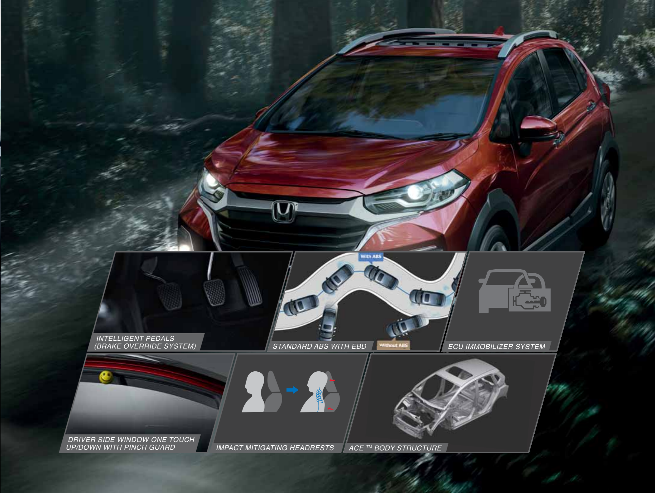
INTELLIGENT PEDALS (BRAKE OVERRIDE SYSTEM)

STATE-OF-THE-ART SAFETY FEATURES THAT KEEP YOUR ADRENALINE PULSING AND YOU DARING TO GO.